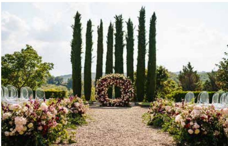
Wedding Ceremony Area