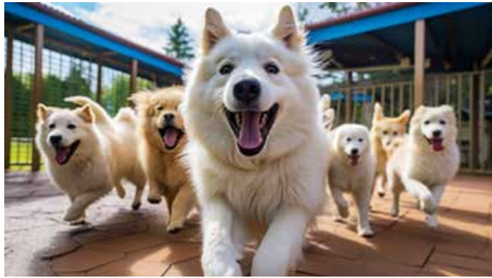
Doggie Sleep area