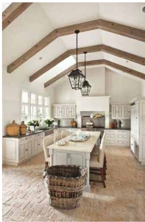
Kitchen & Dining