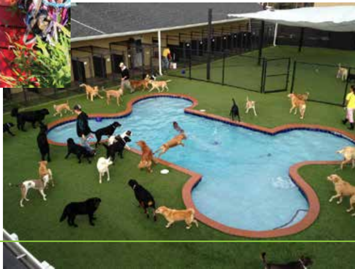
Pond - Pool