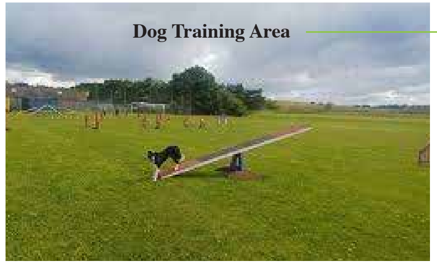
Dog Training Area